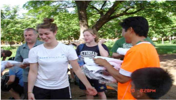
HFCA received donation from Ivanhoe Grammar School