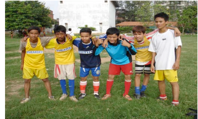
Cambodia team for HWC 2009 in Milan, Italy